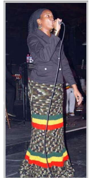
Dezarie, Roots Empress