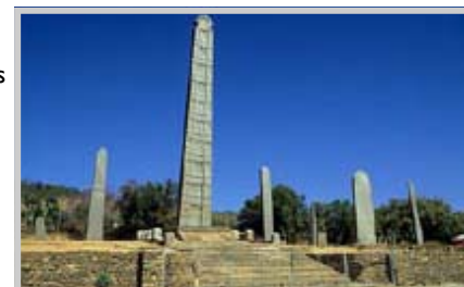
Axum field of Obelisks