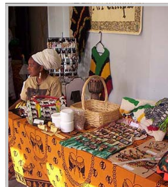
Friday, March 27th A royal sistren vending ilahful Rastafari merchandise at the side door of the Art Temple venue.