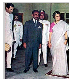
HIM Haile Sellassie I on State visit to India

University training entails deep research and intensive studies. Any research should be related to the requirements and conditions of our country. We are very optimistic that there are many historically valuable things to be discovered. The students of this University are particularly lucky to be of school age at this particular time, and it is Our hope that you will avail yourselves of this exceptional opportunity and contribute to the knowledge of your country in particular and that of mankind in general, by revealing the hidden, great, historic lore. Our University, therefore, has also a special contribution to make in this field.”